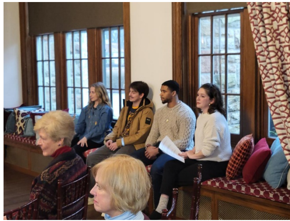
Members of 2026 class, CWRU, Cleveland Play House MFA, performing selections from the play Middletown.